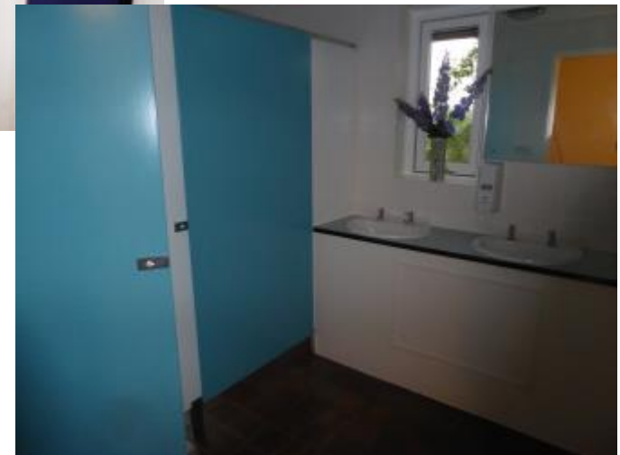
Residents' office and restrooms